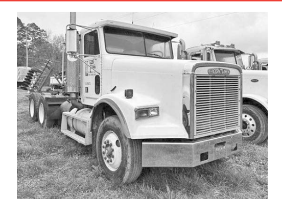
'94 FTL, Series 60 Det., 13 spd., wet line, farm truck, 422,000 miles, $20,500 or best