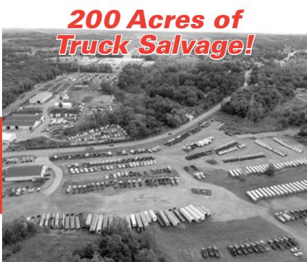
200 Acres of Truck Salvage!