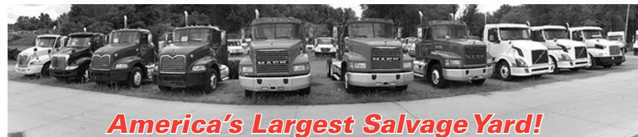
America's Largest Salvage Yard!