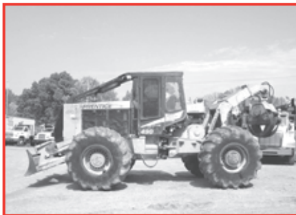
'04 Prentice 490, 5784 Hrs., Esco Grapple, Stock #6102, Price: $49,900.