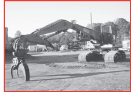
'03 JD 2054, Shovel Loader, Live Heel, Stock# 6045, Price: $150,000.