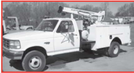
Used Ford Truck, Model: F450, Stock #2871, Price: $36,200 $25,900.