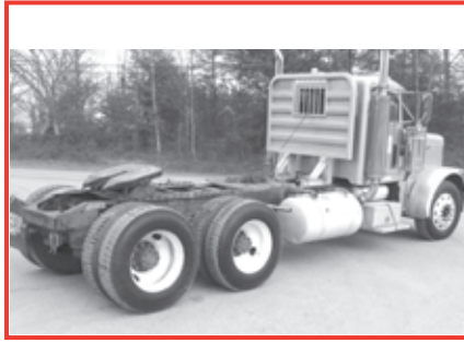
'00 Pete 379, 698,000 Miles, 10 Spd., Stock #6126, Price: $26,000.