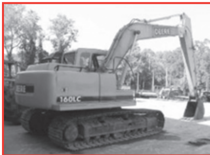
'02 JD 160LC Excavator, U/C Good, 4512 Hrs., Stock #5035, Price: $59,000.