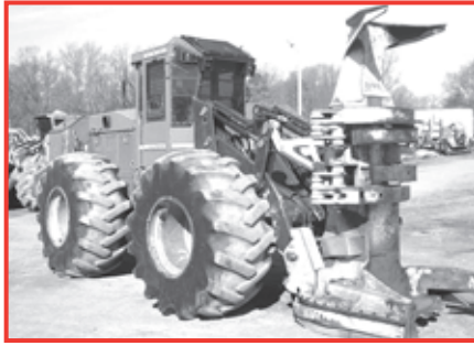
'09 JD 843J Feller Buncher, 3055 Hrs., 22" Cutting Head, Stock #6101, Price: $139,900.