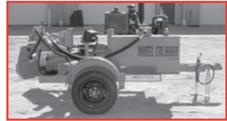
New Multitek Wheel Rim Crusher, Model: WC 500, Stock #4984, Hours: 1, Price: $22,500.