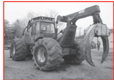
'03 Timberjack 660D Grapple Skidder w/Winch, ZF Axle, Stock #6082, Price: $45,000.