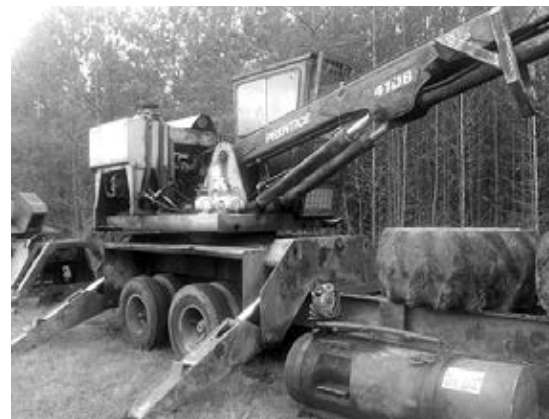
'89 Prentice 410B knuckle boom ldr., very strong & dependable machine, runs great & dry, especially for age, asking $10,000 or best offer. (803) 207-5580