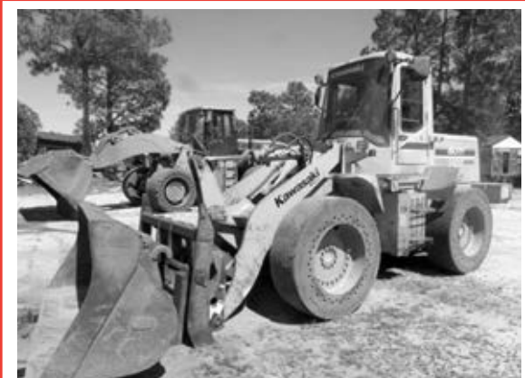
'08 Kawasaki 60ZV-2 w/like new Setco solid rubber tires, JRB hyd. coupler w/2.25 yd. bucket & forks, cab w/cold A/C, 5774 hrs., very good cond., $36,000.