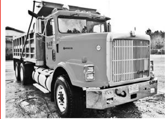
'90 Int'l. 9300 Eagle tdm., Cum. Big Cam, #LC037086, converted, no air bags & extra susp., dependable truck, 18 yrs. of service records, $22,000.