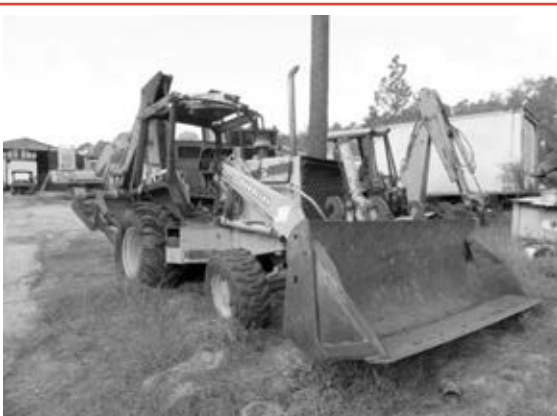
JD 310D 4x4 ldr. backhoe, SALVAGE, many good components remaining on 6100 hr. machine including transmission/trans. axle, most cyls., boom and stick, call for availability. (803) 376-6040