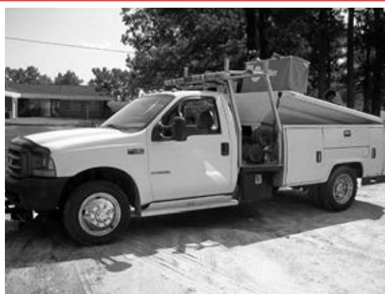
'01 Ford F450 dump/service truck, 4x4, 7.3 dsl., auto., 294,000 miles, 9' elec. dump, Stahl service body, Meyer snowplow frt. attachment, $14,000. (252) 809-2172