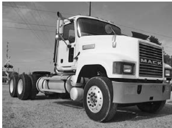
'07 Mack CHN613 T/A day cab, wet line, controls for quad-axle dump, Mack camelback susp., 603,000 miles, $28,000.