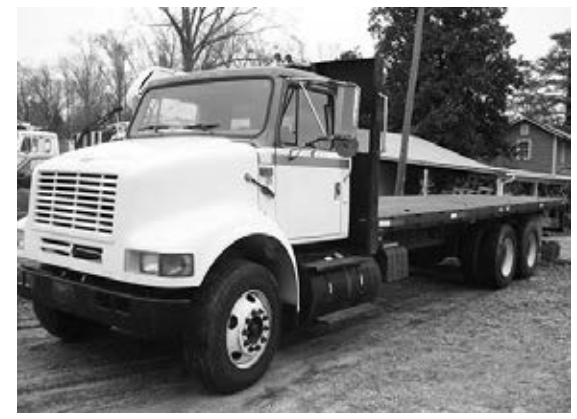
'00 Int'l. 8100 T/A 26' flatbed, Cat dsl., Rockwell 10 spd., 40R, 606,000 miles, 22.5 Budds, $16,000.