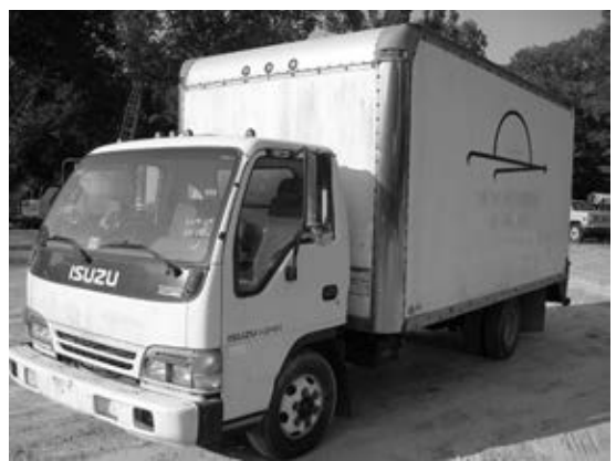
'95 Isuzu box truck, 4 cyl. Isuzu dsl., 5 spd., 241,000 miles, 15' box w/liftgate, $6,500. (252) 809-2172