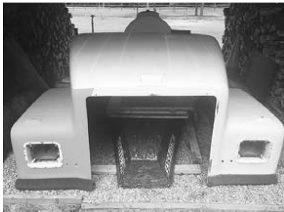
Int'l. Paystar 5000 hood, paint ready, body work completed, fits '98, '99 & '00 Paystar 5000's, $3,200 firm. Fayetteville, NC (910) 309-5961