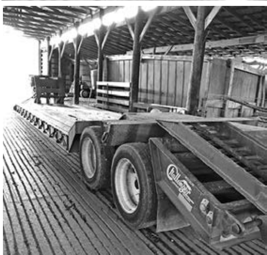
'99 Witzco Challenger, new floor, 42' detach., 35-ton rated lowboy. (704) 985-5728