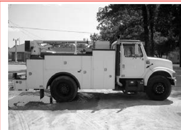
'01 Int'l. 4900 mechanic's service truck, DT466, 7 spd., A/C, w/Autocrane, Ingersoll-Rand hyd. air compressor, Miller Bobcat dsl. 225D welder/generator, 201,000 miles, air ride susp., $16,000. (252) 809-2172