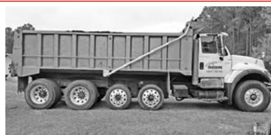
'06 Int'l. 7600 quad dump, C13 Cat motor w/only 200,000 miles, new trans., T1 20' steel dump, $68,500.