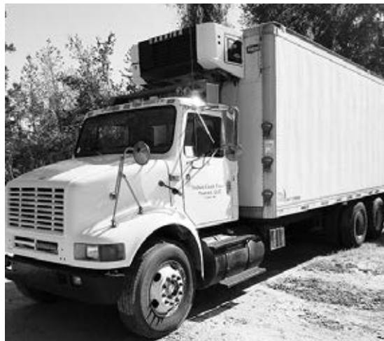
'03 Int'l. 8100, Cat dsl., 10 spd., 26' body, 328,000 miles, all road ready, $20,000. Tyner, NC (252) 221-8768