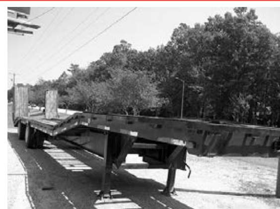
'00 Cherokee 53', 8553 spread axle low-boy equipment trlr., 7' hyd. self contained ramps, 102" wide, LP 22.5 alum. Budds, air ride susp., $17,000. (252) 809-2172