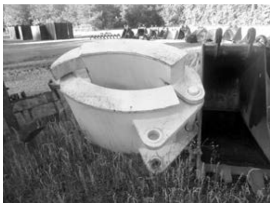
JD 330/892 or Hitachi 330/300 grapple, $850. (803) 376-6040