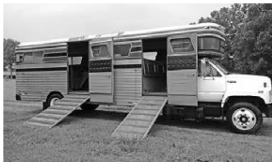
'93 Chevy, 366 eng., auto., 214,000 miles, all alum. horse body, can haul anything or make great camper, asking $6,000 or best offer.