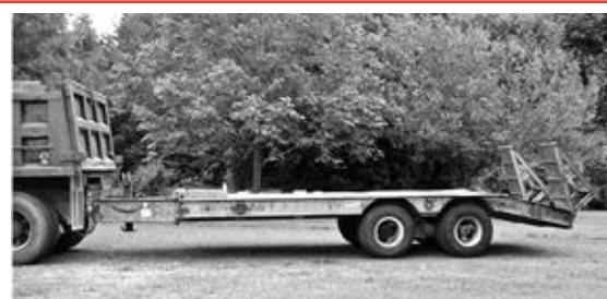
'82 Reid 20-ton trlr., air brakes, good tires, pintle hitch, $4,500.