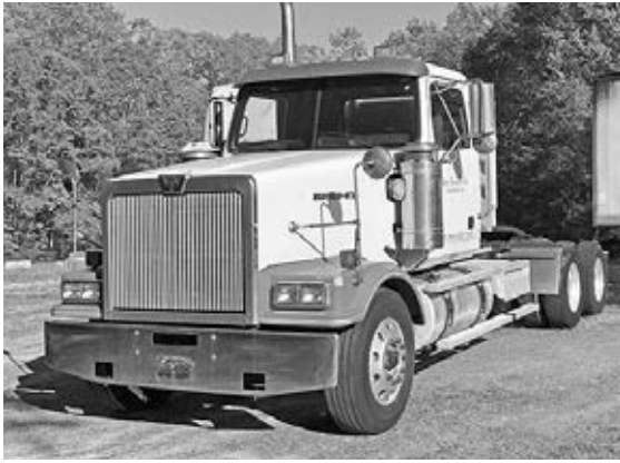
'06 Western Star W B123064T, 515 Det., 13 spd., 42,000 miles since eng. rbl., $33,000 '05 FTL Columbia, Det. pwr. '00 G/Dane paper spec trlr., 53' '01 G/Dane paper spec trlr., 48' Call for more details. (704) 201-5972