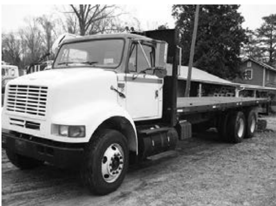
'00 Int'l. 8100 T/A 26' flatbed, Cat dsl., Rockwell 10 spd., 40R, 606,000 miles, 22.5 Budds, $16,000.