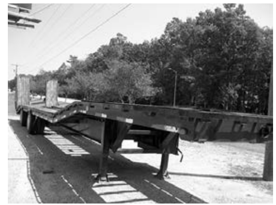
'00 Cherokee 53', 8553 spread axle low-boy equipment trlr., 7' hyd. self contained ramps, 102" wide, LP 22.5 alum. Budds, air ride susp., $17,000. (252) 809-2172