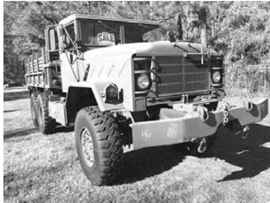
'13 M925A2, rebuild w/19 miles showing, exc. cond., hard top, heater, CTIS new tires, $14,500. (910) 279-4697