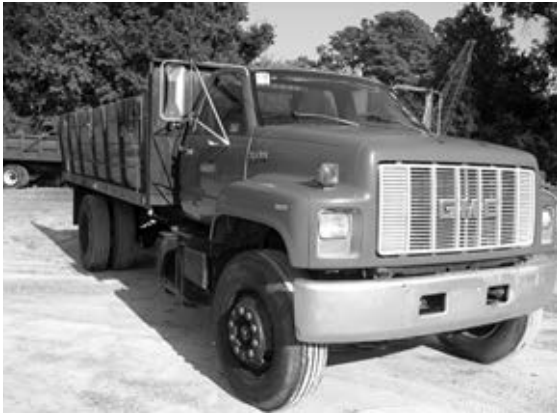
'92 GMC TopKick S/A dump, Cat dsl., 6 spd., air brakes, 16' flat dump, 180,000 miles, toolbox, rear hitch, Budd whls., $12,500.