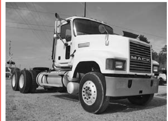
'07 Mack CHN613 T/A day cab, wet line, controls for quad-axle dump, Mack cam-back susp., 603,000 miles, $28,000. (252) 809-2172