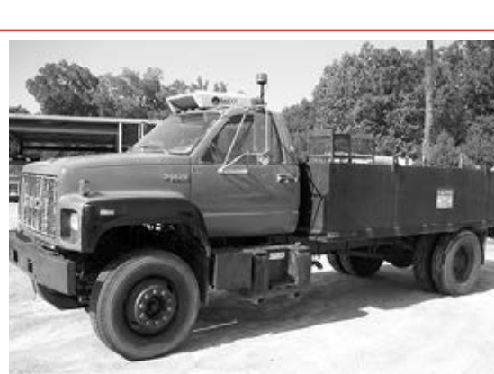
'94 GMC TopKick C7500 S/A water truck, 366 gas eng., 5 spd., 75,000 miles, 22.5 Budds, cold A/C, 2200-gal. tank, PTO driven pump, rear discharge, $9,500. (252) 809-2172