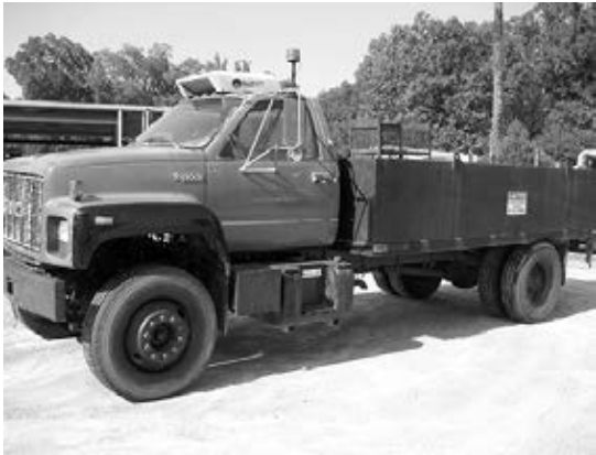
'94 GMC TopKick C7500 S/A water truck, 366 gas eng., 5 spd., 75,000 miles, 22.5 Budds, cold A/C, 2200-gal. tank, PTO driven pump, rear discharge, $9,500.