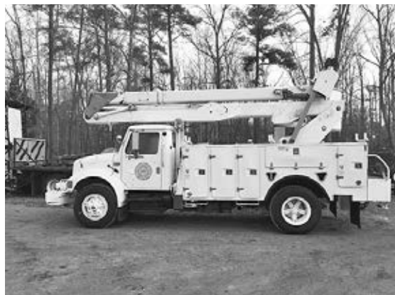
'91 Int'l. 4900 bucket truck, 156,000 miles, 50' boom, DT466 dsl., $15,500 or call for best offer..