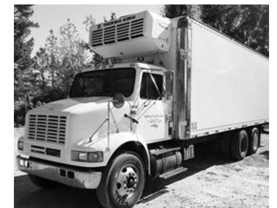
'96 Int'l. 8100, Cum. dsl., new 10 spd. & clutch, 26' body, 350,000 miles, $16,000. Tyner, NC (252) 221-8768