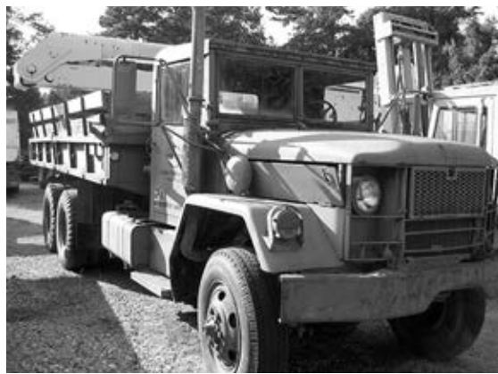
Army 6x6 dump truck, 18' twin cyl. flat-bed dump, 2-1/2 ton 6x6 M36A2, multi fuel dsl., 5 spd., hard top, 16,000 miles, $8,500. (252) 809-2172