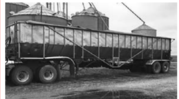
'04 Trinity Eagle belt trlr., tires & brakes very good, chain 2-yrs. old, new tarp, $36,000.