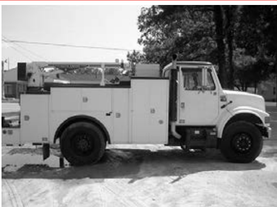
'01 Int'l. 4900 mechanic's service truck, DT466, 7 spd., A/C, w/Autocrane, Ingersoll-Rand hyd. air compressor, Miller Bobcat dsl. 225D welder/generator, 201,000 miles, air ride susp., $16,000.