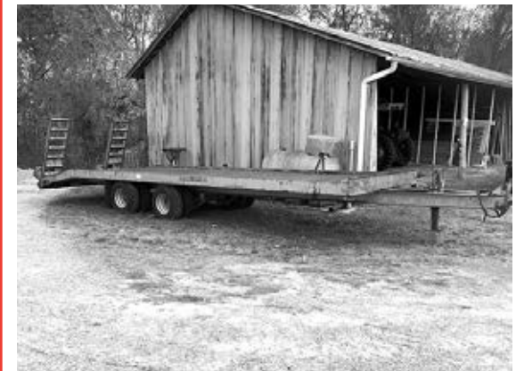
'88 Reid trlr., 12-ton, 21' deck, new tires, $5,500.