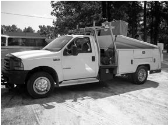
'01 Ford F450 dump/service truck, 4x4, 7.3 dsl., auto., 294,000 miles, 9' elec. dump, Stahl service body, Meyer snowplow frt. attachment, $14,000. (252) 809-2172