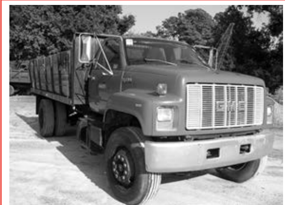
'92 GMC TopKick S/A dump, Cat dsl., 6 spd., air brakes, 16' flat dump, 180,000 miles, toolbox, rear hitch, Budd whls., $12,500. (252) 809-2172