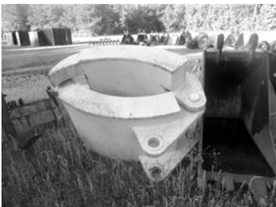
JD 330/892 or Hitachi 330/300 grapple, $850. (803) 376-6040