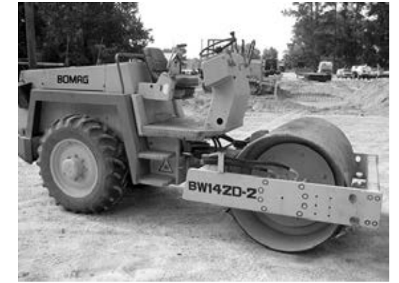
Bomag BW142D-2 smooth drum roller, 56" drum drive, Deutz dsl., low hrs., $21,000.