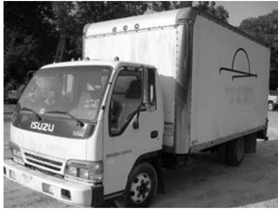
'95 Isuzu box truck, 4 cyl. Isuzu dsl., 5 spd., 241,000 miles, 15' box w/liftgate, $6,500.