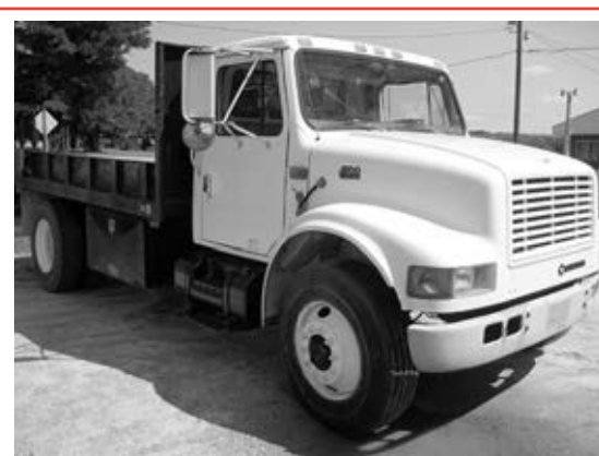
'00 Int'l. 4700 S/A dump truck, 7.3 dsl., auto., hyd. brakes, 14' flat dump, 22.5 Budds, 256,000 miles, 4' toolbox, $11,500. (252) 809-2172