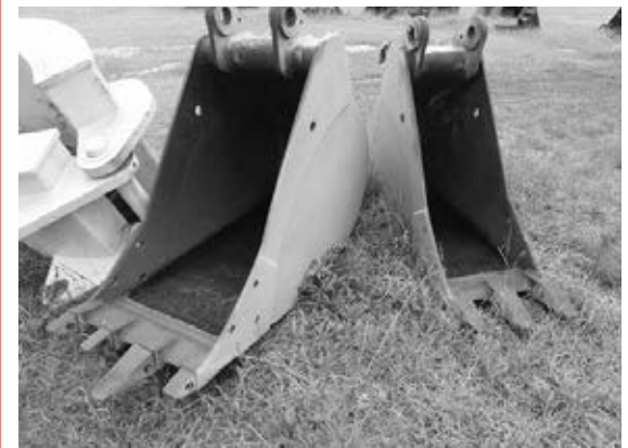
(2) Cat 225 excavator buckets, 28" & 22", in good cond., both for $700. (803) 376-6040