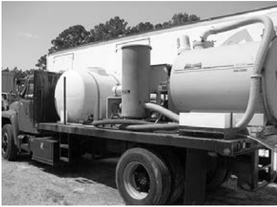
S/A vacuum truck, Vac-Tron MC 500G mini combo, self dump, 1670 unit hrs., (2) Kohler Pro 24 hp engs., 525-gal. water tank, mtd. on '85 Int'l. S/A 16' flatbed, DT466 eng., 5 spd., air brakes, $9,500.