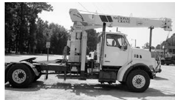
'02 Sterling L7500 S/A boom, truck, National 437A, 10-ton hyd. crane, 47' sheave ht., dual controls, (4) outriggers, Cat 3126 dsl., 9 spd., 210,000 miles, NEW 22.5 tires, 5th whl., very nice, $30,000. (252) 809-2172