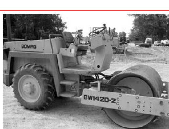
Bomag BW142D-2 smooth drum roller, 56" drum drive, Deutz dsl., low hrs., $21,000. (252) 809-2172