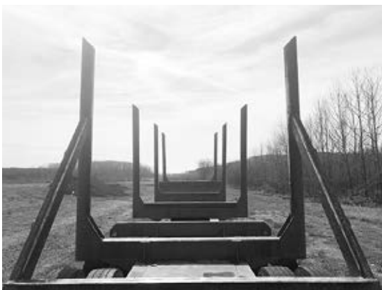
'01 White's drop deck log trlr., 42' long, 96" wide, $13,000.