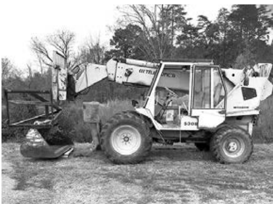
'87 JCB 530B, 8000# 36' lift, 4WD, bucket & truss boom, 1-owner, $17,900.