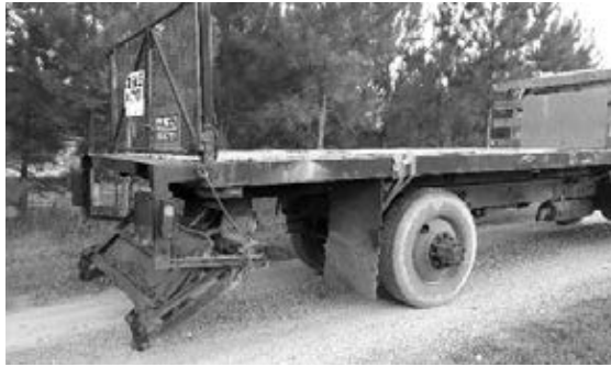
20x8 Truck flatbed, bed only, truck is not for sale, w/hyd. liftgate, alum. diamond tread floor, $1,000 or best offer.