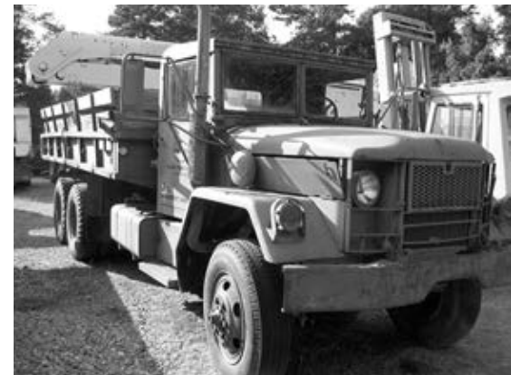
Army 6x6 dump truck, 18' twin cyl. flat-bed dump, 2-1/2 ton 6x6 M36A2, multi fuel dsl., 5 spd., hard top, 16,000 miles, $8,500. (252) 809-2172