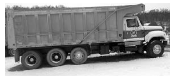
'00 Int'l. tri-axle, N14 Cum. Select, 525 hp, Jake, 18 spd., 46 Rockwell, some tractors left, (1) dump trlr., retiring after 60 years of trucking.