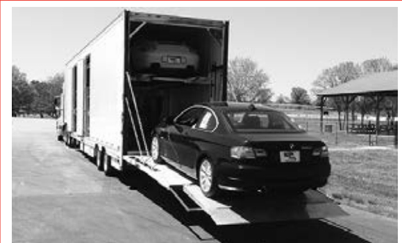
4- Or 5-car liftgate encl. transport, dsl. generator, PTO driven hyd., will make a great race trlr., needs very little work, $28,000 or best offer.