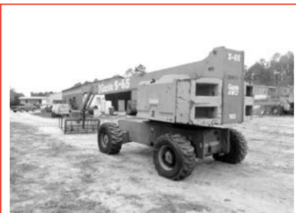
'96 Genie S-65 4WD 65' telescoping man lift, 6893 hrs., Ford LRG 423 gas/propane eng., WILL NOT START, only ground aux. controls work, sold as-is, where-is, $5,500.