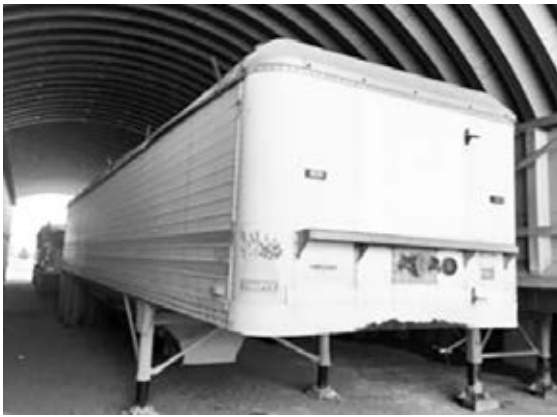
'80 Timpco hopper trlr., 38' alum., tires & brakes, very good, tarp good, $7,000. (252) 943-1433