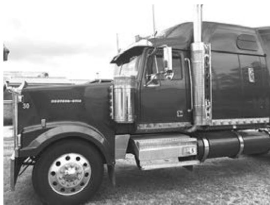
'05 Western Star 4900 EX tractor truck, 500 Det., 18 spd., new tires, alum. whls., good brakes, very clean truck, asking $32,000.