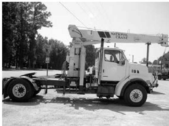
'02 Sterling L7500 S/A boom, truck, National 437A, 10-ton hyd. crane, 47' sheave ht., dual controls, (4) outriggers, Cat 3126 dsl., 9 spd., 210,000 miles, NEW 22.5 tires, 5th whl., very nice, $30,000. (252) 809-2172