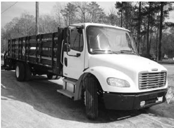
'05 FTL S/A, 24' flatbed, liftgate, C7 Cat dsl., 6 spd., 206,000 miles, air brakes, $16,000.