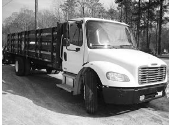
'05 FTL S/A, 24' flatbed, liftgate, C7 Cat dsl., 6 spd., 206,000 miles, air brakes, $16,000.