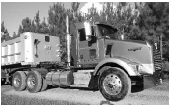
'06 KW T800, ISX Cum., new 10 spd. FRO1821C, new 3.70 ratio, new windshield, new king pins, wet line kit, virgin rubber on 24.5 pol. alum. whls., (2) 100-gal. tanks, new dual exhaust, V.I.T. int., too much new stuff to list, asking $36,500 or best offer. (704) 791-7618