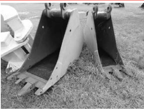
(2) Cat 225 excavator buckets, 28" & 22", in good cond., both for $700. (803) 376-6040