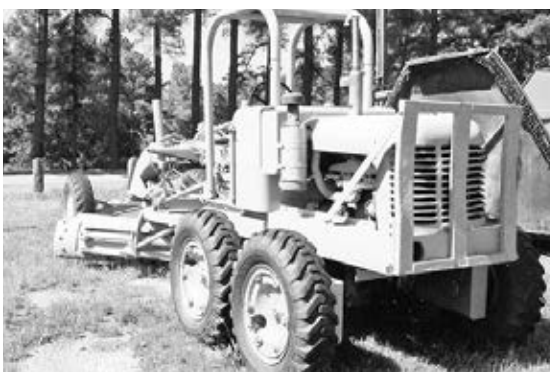
Fiat Allis AC DD motor grader, 2300 hrs. on meter, PS, hyd. side shift, dsl. eng., scarifiers, serviced, oil & filters good cond., $10,500, near Danville, VA, phone Elmer, no texts.